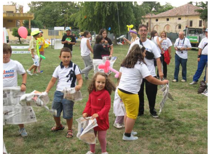
Children playing at a neighbourhood party in Rovigo, Italy

In Italy , 18 public social housing companies throughout the country, members of the federation FederCasa, organised neighbourhood events in cooperation with municipalities.