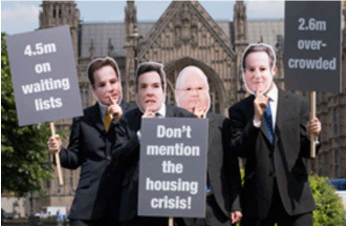
Housing campaigners wear face masks of Cameron, Clegg, Osborne and Pickles on Budget Day

viders not only offer exceptional value for money but the construction of housing delivers the range of economic benefits that the Government has indicated it wishes to support. However, the Chancellor announced that unprotected Departmental budgets, which would include Communities and Local Government, could see Budget cuts of at least 25% between 2011-12 and 2014 -15.