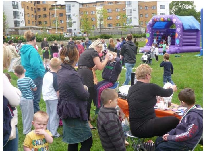
Families celebrating Neighbours' Day in Stepside, Ireland

the Irish Council for Social Housing got involved." He added: "The ICSH joined with our European partners in promoting this day to highlight the importance of knowing your neighbour. It is the most basic step to improving our communities and to encouraging cohesion. "