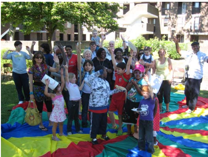
Making friends with neighbours in Clifford Haigh House, London

Dozens of neighbours became new friends at Sheperds Bush Housing Group Neighbours' Day celebration at Clifford Haigh House, in London, England .