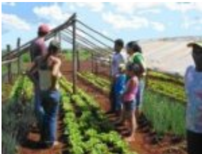
Image from the project winner of 2009 award, Caprichando a Morada (Brazil)

The World Habitat Awards competition has a two-stage entry process: stage I submissions need only comprise a summary of the key aspects of the project. From these preliminary submissions, ten projects are selected by an Assessment Committee to go forward to Stage II of the competition.